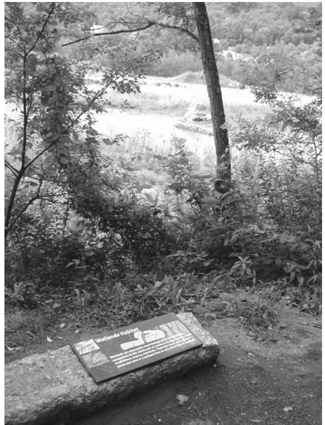
An informative sign along the Ghost Town Trail. One of Twenty signs that can be currently found on sight.

AMD&ART hopes that the signs will be an effective teaching tool to those intersted in the site and that they will help spread the message of passive AMD treatment systems around coal country.