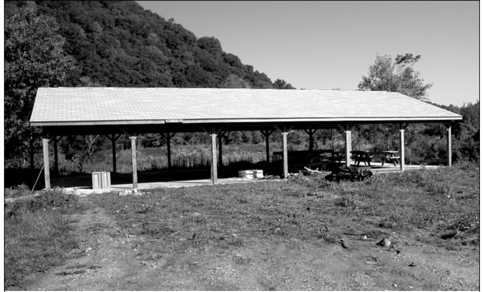
Newly completed AMD&ART Park recreational pavilion. With funding from the United States Forest Service, the pavilion was constructed by the Naval Mobile Construction Battalion 23.