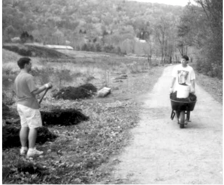
The boys of the Greystone House of Adelphoi , located in Jennerstown, working hard to plant trees before winter sets in at the AMD&ART Vintondale site.